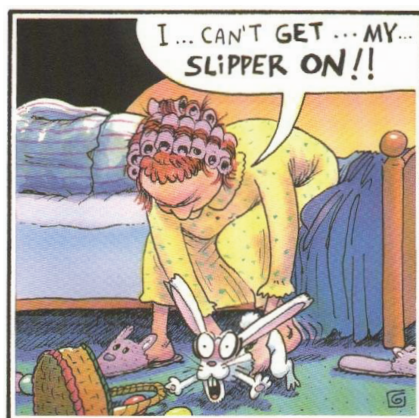
THE EASTER BUNNY GETS A RUDE AWAKENING.