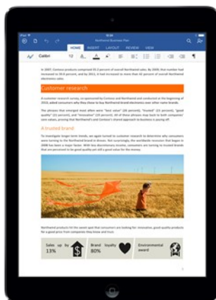
Used with permission from Microsoft.

Just about everything you're used to within the Office Suite is here on the iPad, optimized for touch screens. These three apps are feature-rich, powerful business tools. And while a menu item or two might be out of place, you'll soon quickly adapt to the user interface. If you've used an iPad and you've used Office on your desktop, you'll be just fine. Advanced features such as change tracking, find and replace are all there, and while there still may be a few things you need to do on your desktop, we're hard-pressed to find many of them.